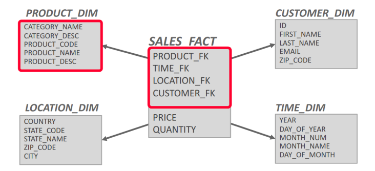
Figure 1: Star Schema – The center of the schema is the SALES fact table that contains key references to outer dimension tables. Because star schemas are only onedimensional, the outer dimensional tables cannot point to other dimension tables.